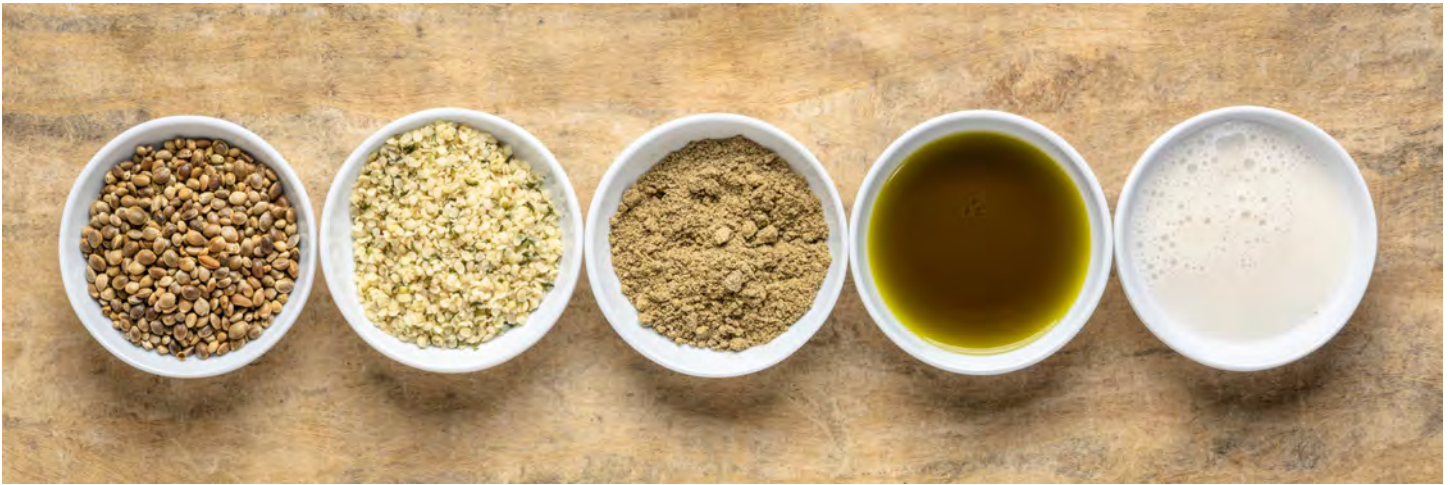
Hemp seed products: hearts, protein powder, oil & milk

To build upon ongoing collaborations and coordination across the hemp industry, Oregon State University's Global Hemp Innovation Center and the USDA co-organized the National Hemp Industry Research Needs Workshop in November 2022. The workshop brought together leaders from academia, industry, and government to identify the significant gaps, challenges, and opportunities for research to support development of a globally competitive U.S. hemp industry. The Workshop focused on six topics spanning all aspects of hemp value chains: plant breeding and genetics, sustainable agricultural production, harvest and materials processing, product manufacturing and supply chains, economics and markets, and testing and compliance.