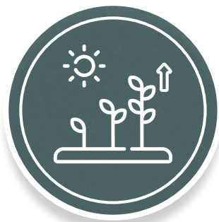
Best Practices for Production