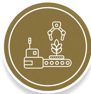
Biobased Products Manufacturing for End-Uses