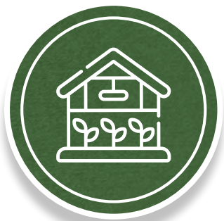
Breeding and Genetics

This roadmap categorized four hemp research needs areas with overarching goals: