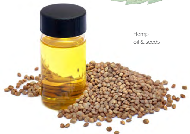
Hemp oil & seeds

To identify and adopt optimized hemp production practices, the public and private sectors must recognize what producers need. The public sector should coordinate large-scale and regionalized performance trials for foundational management knowledge including planting and harvest schedules, input usage, and variety recommendations. Furthermore, the public sector should facilitate the sharing of knowledge through variety choice guides, production guides, and enterprise budgets to show potential costs and returns. The public sector also has a key role in identifying sustainable practices for hemp production and how best to encourage those practices. The private sector must forge partnerships across companies to facilitate the concurrent development of innovative products to serve the needs of producers and the large production landscape. Additionally, the private sector must develop products with a common goal of generating returns on investment for both companies and the producer.